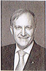
Peter Julian MP / Député New Westminster-Burnaby

Room 629-C, Centre Block Ottawa, ON K1A 0A6 Phone: 613.992.4214 Fax: 613.947.9500 peter.julian@parl.gc.ca