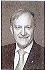
Peter Julian MP / Député New Westminster-Burnaby

Room 629-C, Centre Block Ottawa, ON K1A 0A6 Phone: 613.992.4214 Fax: 613.947.9500 peter.julian@parl.gc.ca