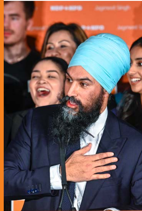
Jagmeet Singh NDP + NDP

These long-term changes are ambitious and achievable. But we know that we also need to make immediate changes to improve the quality of care for people living in these facilities right now.